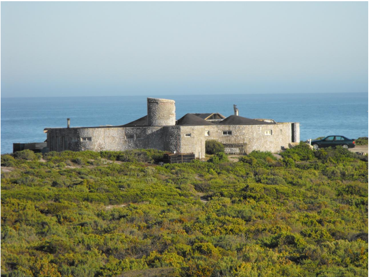
GROOTVLEI GUEST HOUSE ON THE DUNES

Fronting the crashing waves on the beach below, this intimate venue captures the rugged, unpretentious soul of the West Coast. Constructed with a unique shell clad exterior and natural flooring of shells collected from the surrounding beaches, the oval shaped building with lattice roofing lends itself to informal entertaining. Carefully placed windows all around as well as a large volume main exit allows for uninterrupted views of the coastline. The venue lends itself to smaller sized special occasions - whether it be a memorable wedding reception, the authentic closure of a team building experience or hosting the performing arts in a unique setting.